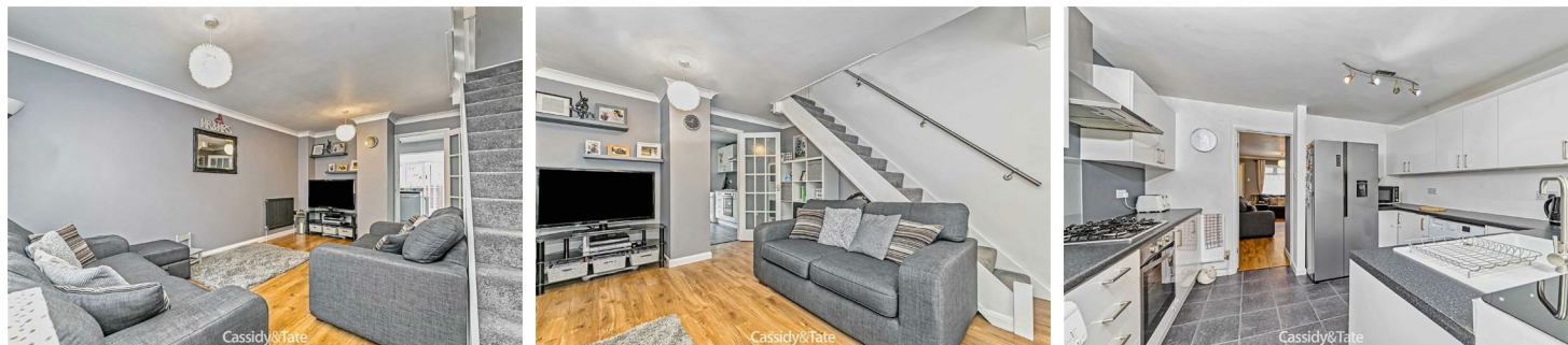
Ground Floor Approx. 449.1 sq. feet

This lovely refurbished two double bedroom extended mid terrace property is tucked away in a quiet cul de sac location in the ever popular Jersey Farm. With well proportioned accommodation the property enjoys a lounge, extended kitchen dining/family room with doors that open out on to the garden, two double sized bedrooms, and a recently refitted white bathroom suite. There is an enclosed low maintenance rear garden with a rear access gate. Having gas central heating, double glazing and a garage en bloc with communal parking close by Jersey Farm is located to the North East side of St Albans and benefits from its own parade of shops, doctor and dentist surgeries nearby with a further range of shops at the Quadrant shopping centre. The more comprehensive shopping and leisure facilities of the city centre and the mainline railway station remain only a short car or bus ride away. There are good local junior and senior schools close by as well.